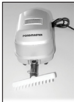
AP-40 with included air diffuser and short hose section