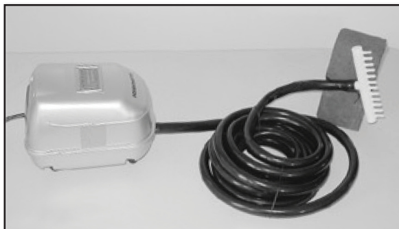
AP-40 with an added hose section and included air diffuser